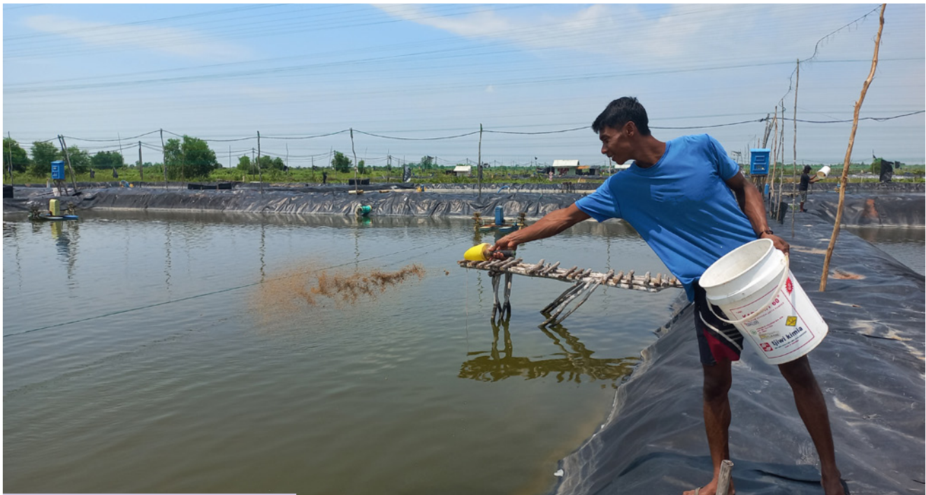
Feeding at Tambak Udang Babarafi, Indonesia