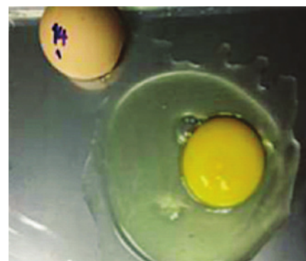
Fig. 2. The effect of dietary selenium on egg freshness (Haugh unit) (Thailand, 2016). Left, sodium selenite 0.3ppm. Right, Selisseo 0.3ppm.

used in food manufacture, as a powder or in liquid form. In the industry, eggs are appreciated for their colouring, binding, gelling, foaming, emulsifying and nutritional properties.