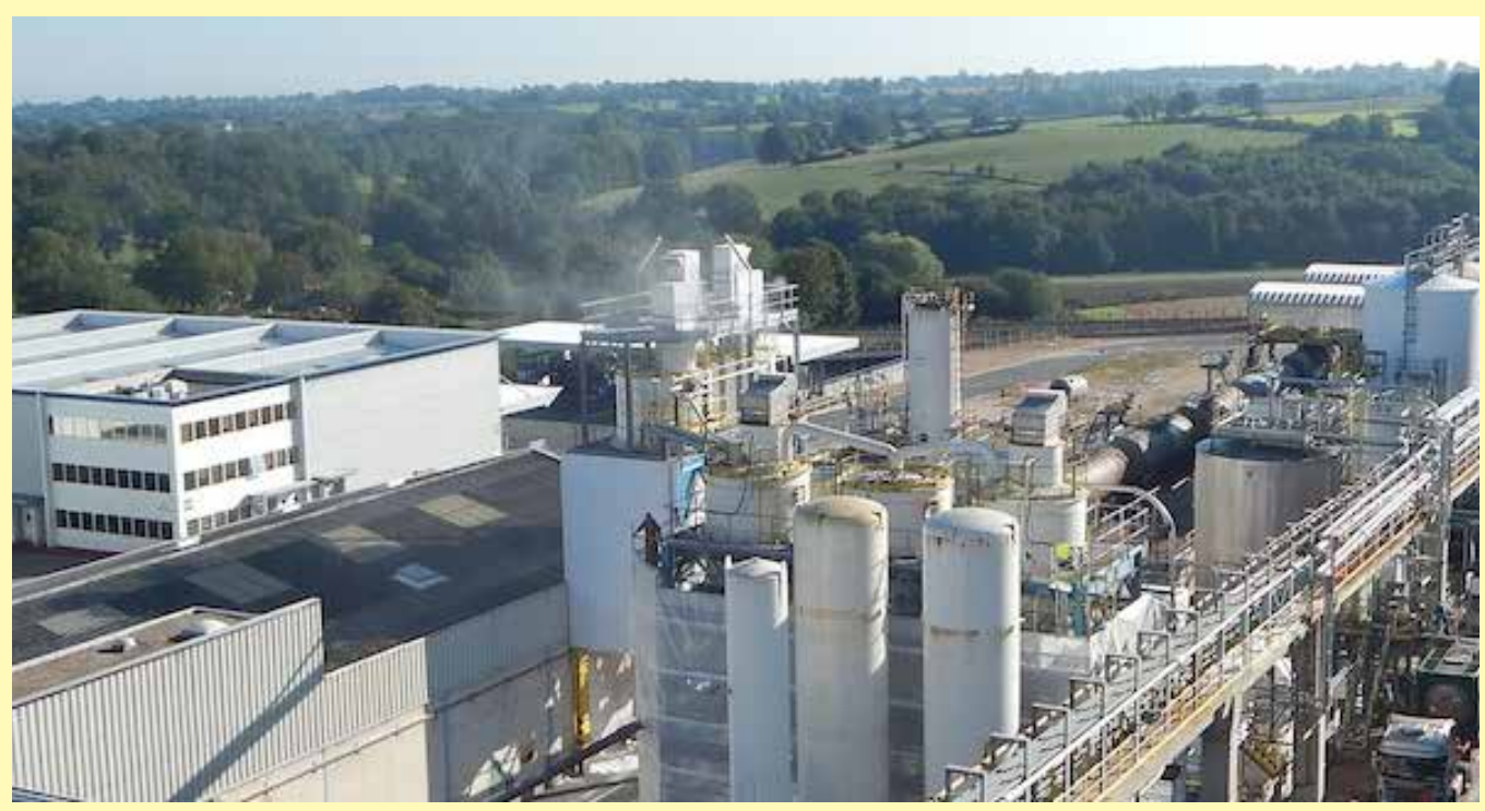
Adisseo's plant in Commentry, the birthplace of methionine production.